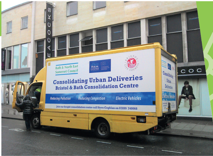
◀ Urban freight transport